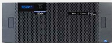
EMC Isilon NL410

The challenge of cost-effectively storing and managing data is an ever-growing concern. You have to weigh the cost of storing certain aging data sets against the need for quick access. Meeting this challenge requires a solution that bridges the gap between high-performance (but costly) primary storage and inexpensive (but management-intensive) offline storage solutions.