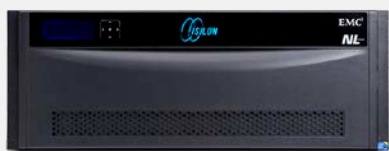
EMC Isilon NL400